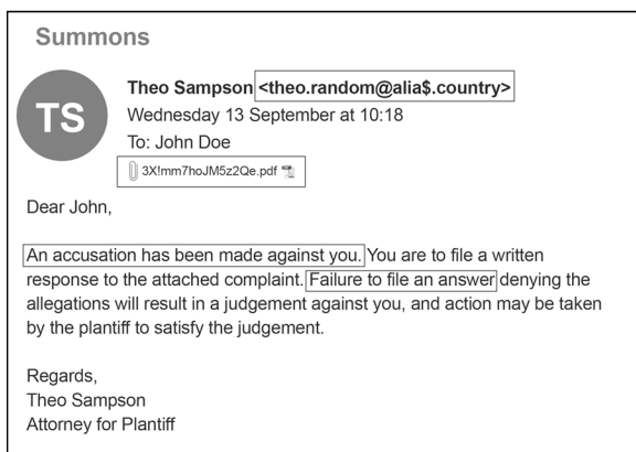
FIGURE 2-3: A phishing email example with highlighted indicators of threats.