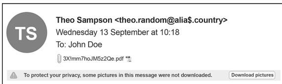
FIGURE 2-2: An example warning message when image is included.

To prevent sharing information about your device and location, make sure to disable automatic image downloads in your email client. That way you control when to download images from incoming email.