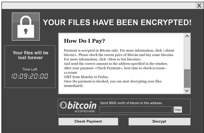
FIGURE 2-1: A typical ransomware message.

If you have a ransomware attack, you know almost immediately because you see a message from the cybercriminal that your files have been encrypted or that you have been locked out of your computer. Note that it's common to see mistakes in spelling and formatting in these types of messages. This message can look similar to Figure 2-1. You will then be asked to pay a ransom to get an encryption key and restore your files. Payment is typically demanded in Bitcoins or some other well-known cryptocurrency.